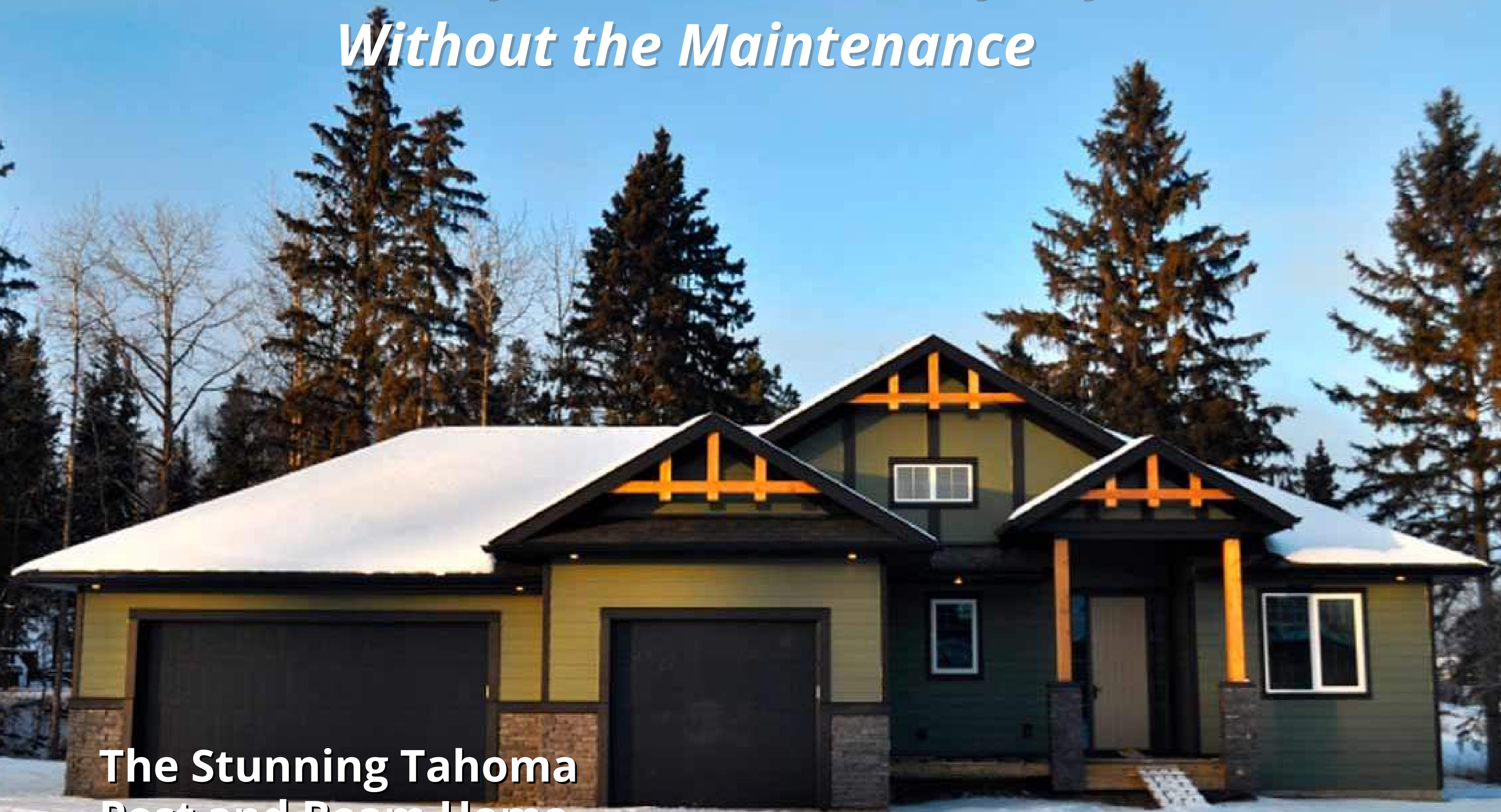
The Stunning Tahoma Post and Beam Home The Perfect Custom Neighborhood Design!

Luxury Custom Home Lifestyle... Without the Maintenance