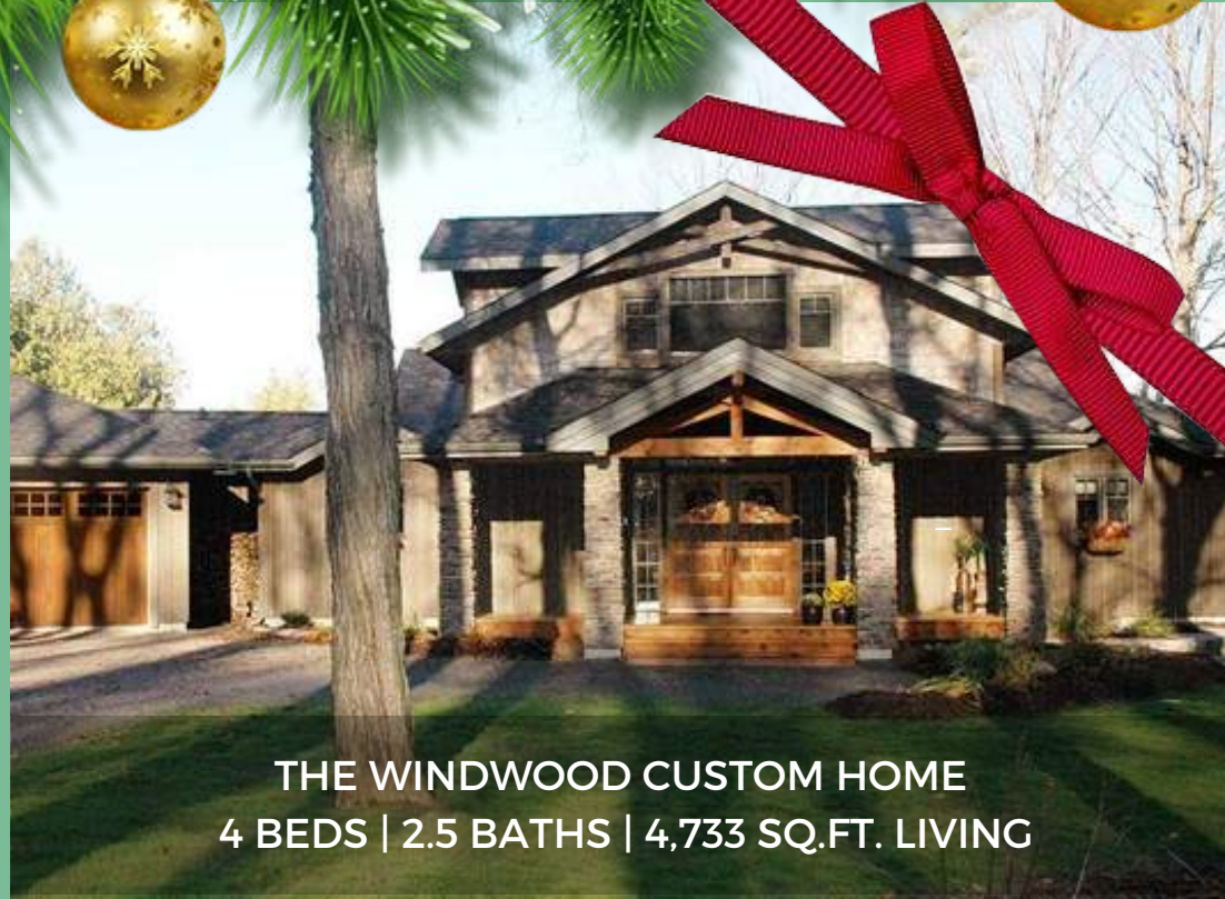
THE WINDWOOD CUSTOM HOME 4 BEDS | 2.5 BATHS | 4,733 SQ.FT. LIVING