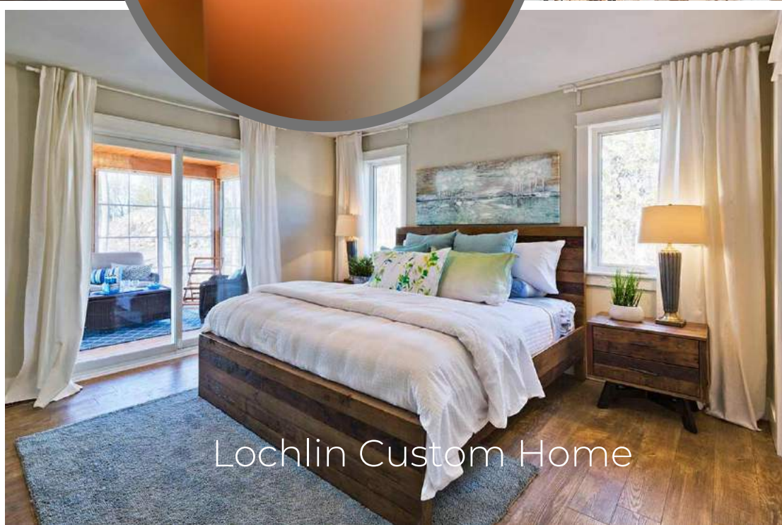
Lochlin Custom Home