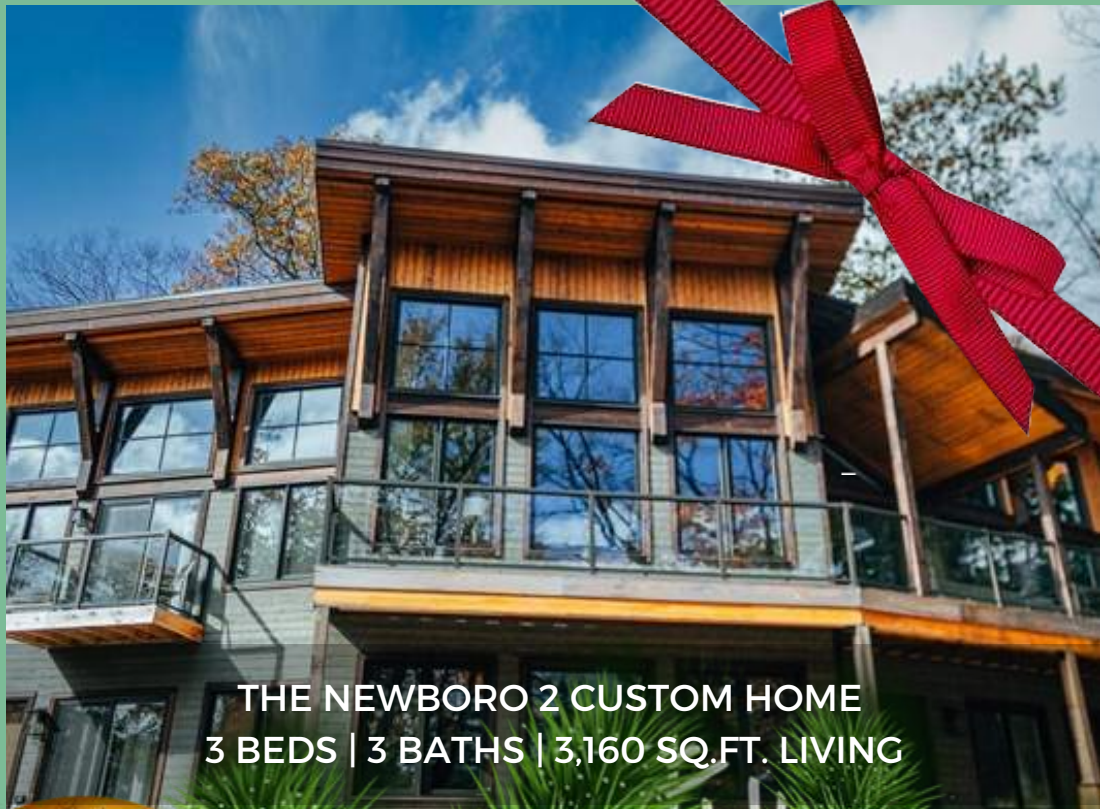
THE NEWBORO 2 CUSTOM HOME 3 BEDS | 3 BATHS | 3,160 SQ.FT. LIVING