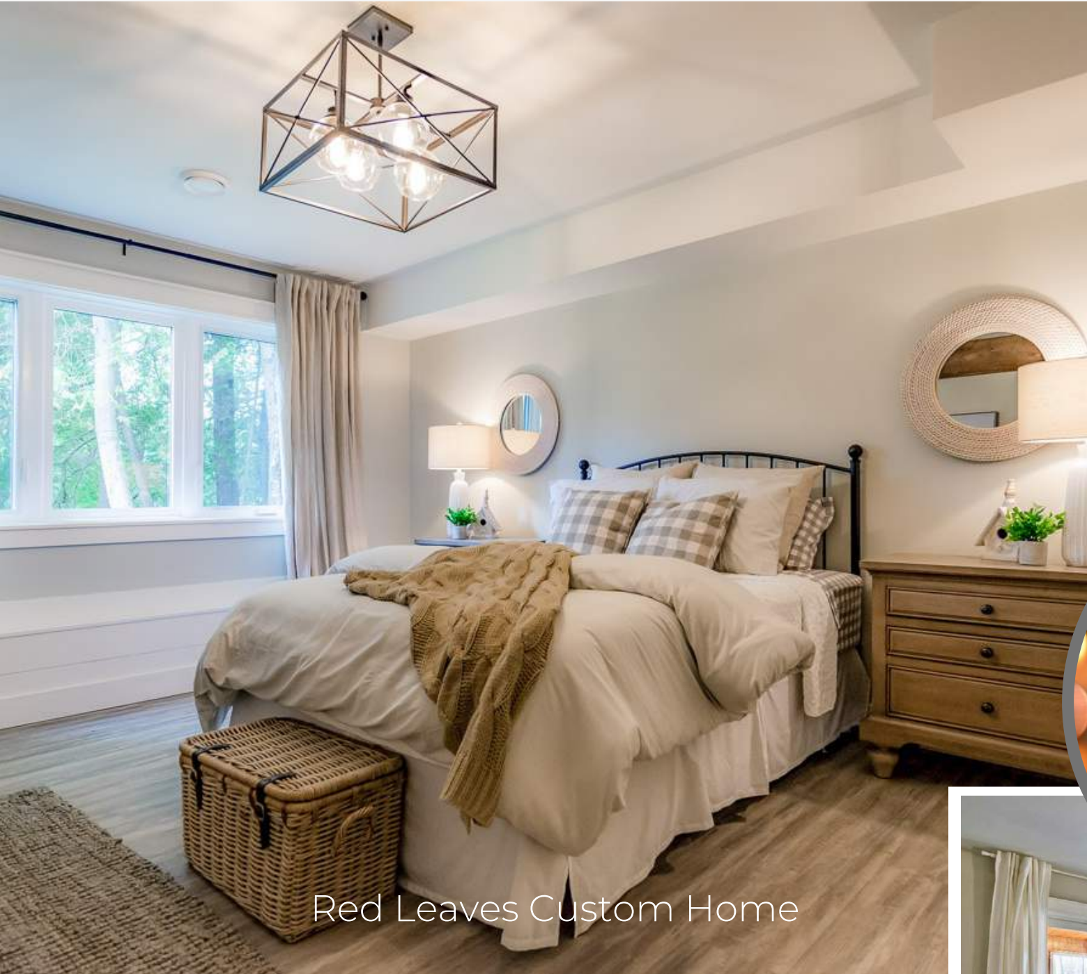
Red Leaves Custom Home

Consider changing out your window coverings as the seasons change. While purchasing a second set of heavier fabric curtains is an additional expense, it will be well worth it because the benefits are twofold.