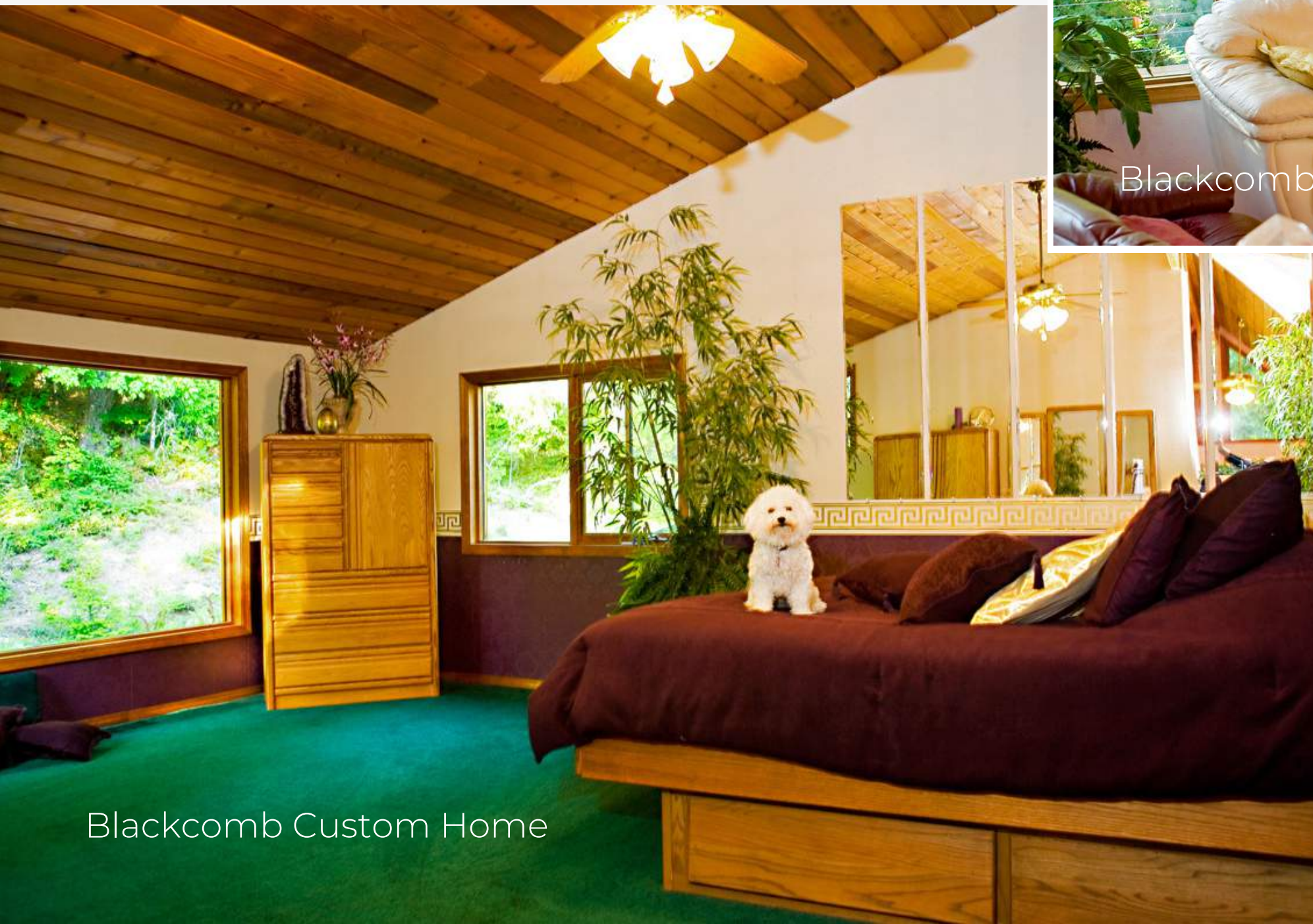
Blackcomb Custom Home