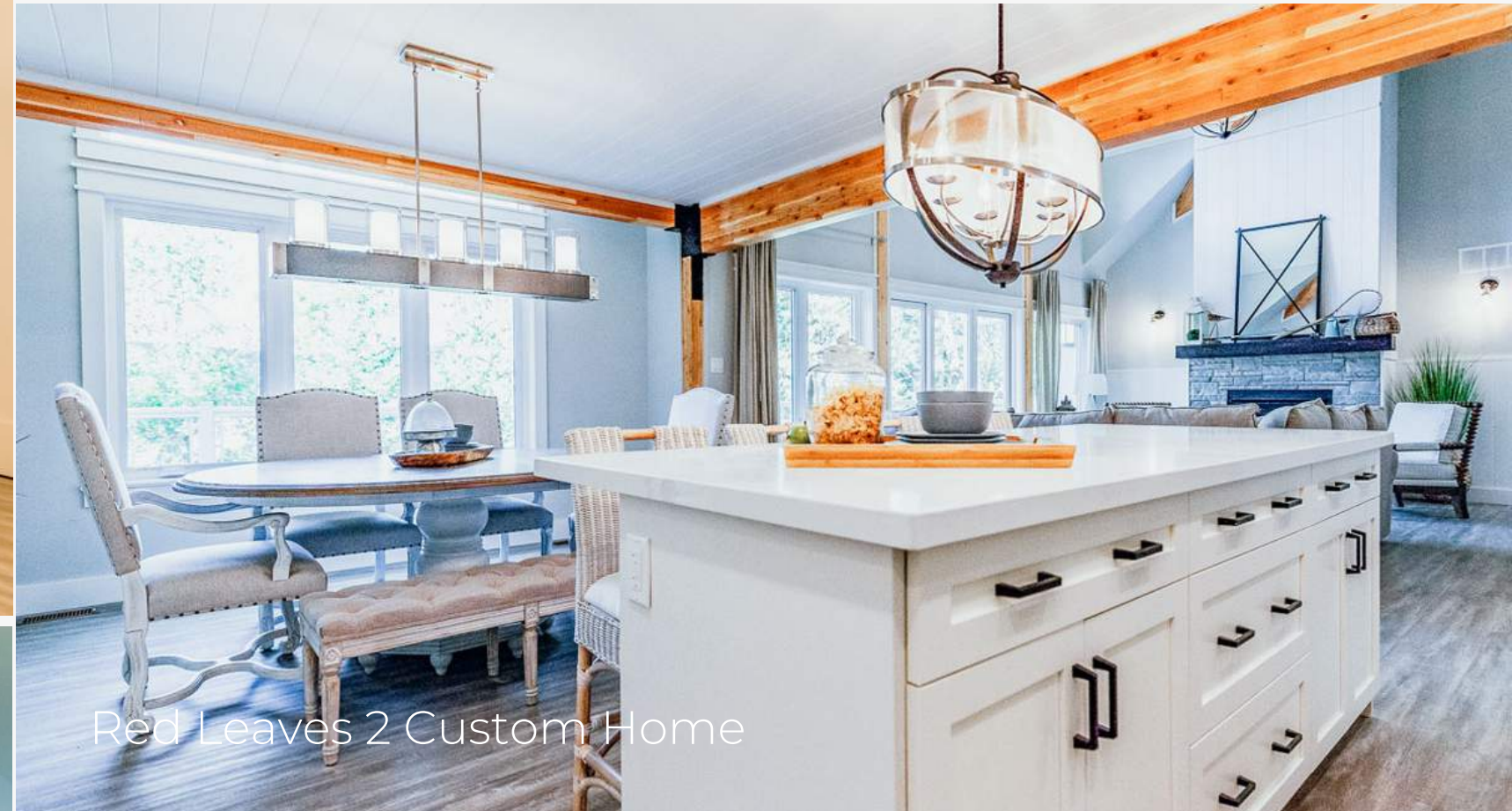
Red Leaves 2 Custom Home

Bright white is a neutral color that is neither yellow (on the warm side) nor blue (on the cool side). Simply replace your brilliant white bulbs with soft white bulbs to warm up the look of your house. Soft white bulbs are a little warmer tint and a popular choice in living rooms. And bedrooms, where a warm atmosphere is usually desired.