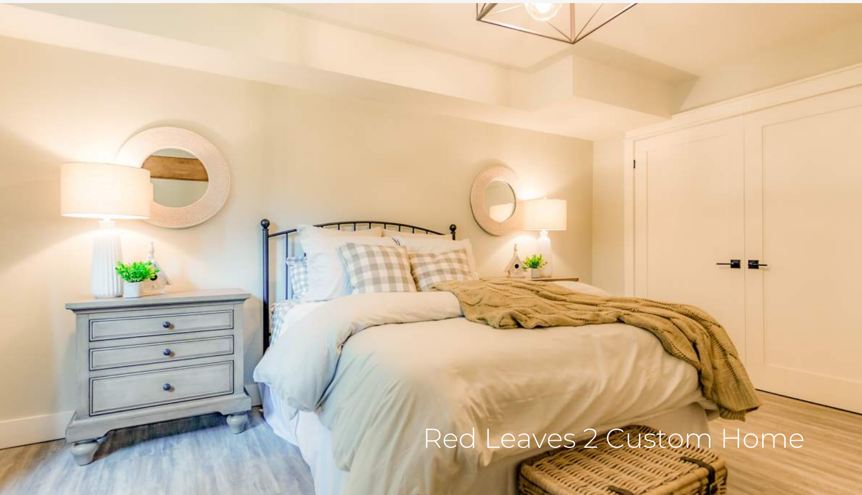
Red Leaves 2 Custom Home