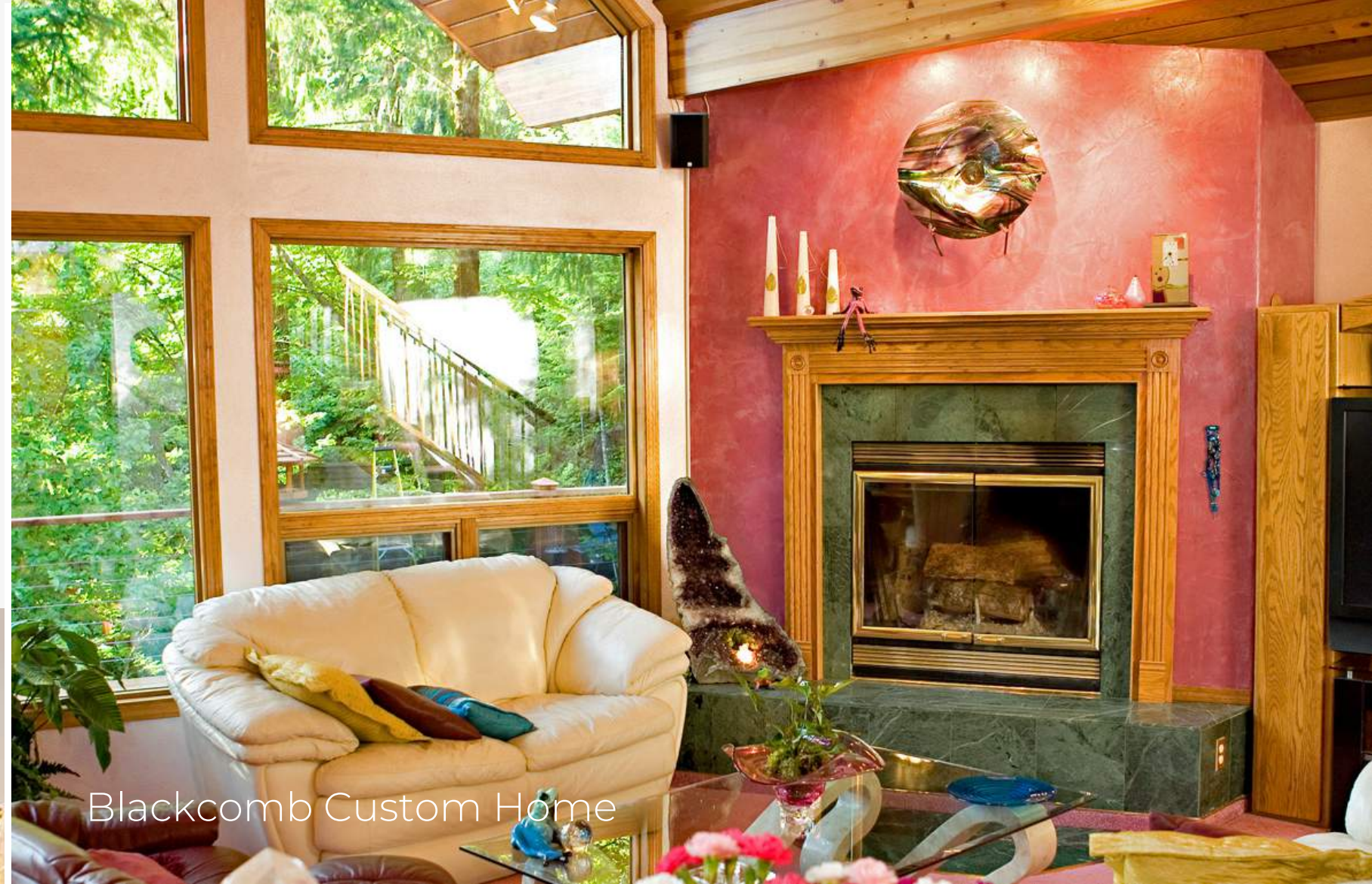
Blackcomb Custom Home

Just as the weather influences what you wear, it should also influence what you have in your home. Your space will be as cozy as can be, regardless of the weather outside, by incorporating some important aspects into your décor. Here are a few methods to turn up the heat without turning on the heat.