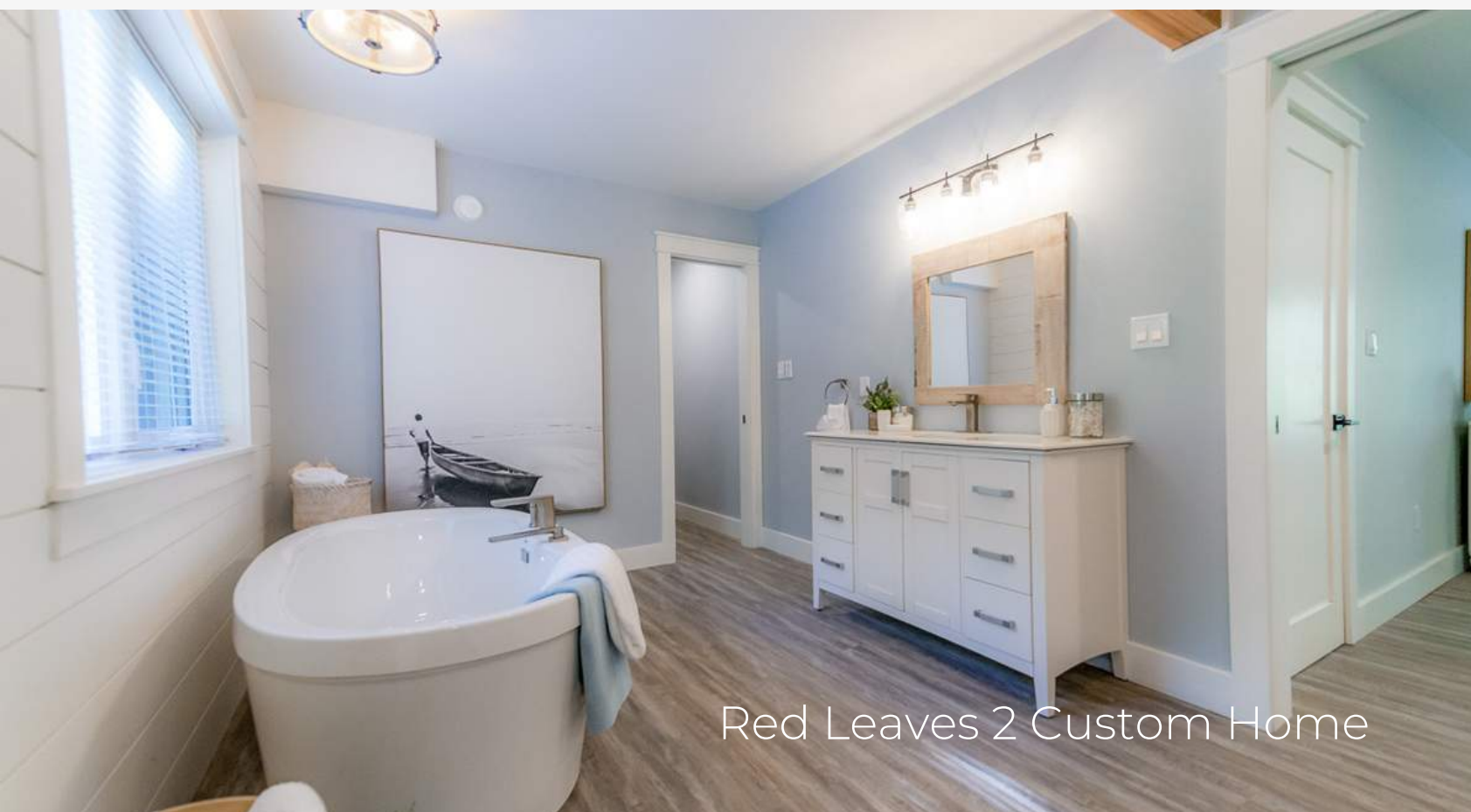
Red Leaves 2 Custom Home

The standalone tub is the new center of attention. It looks to float, taking up less space than a built-in and being easier to clean than a built-in.