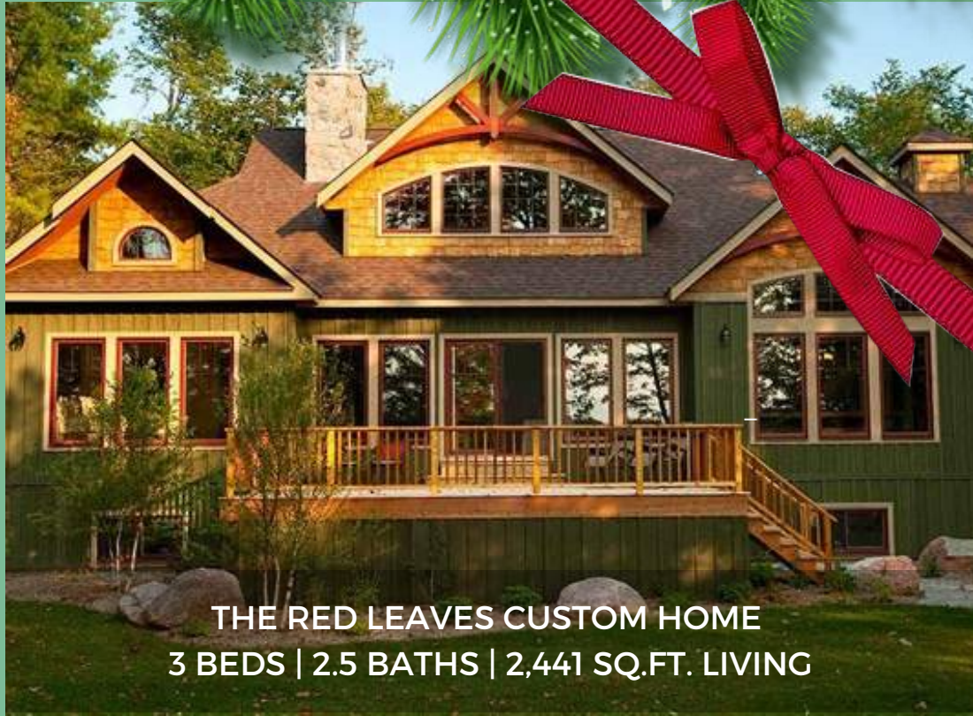
THE RED LEAVES CUSTOM HOME 3 BEDS | 2.5 BATHS | 2,441 SQ.FT. LIVING