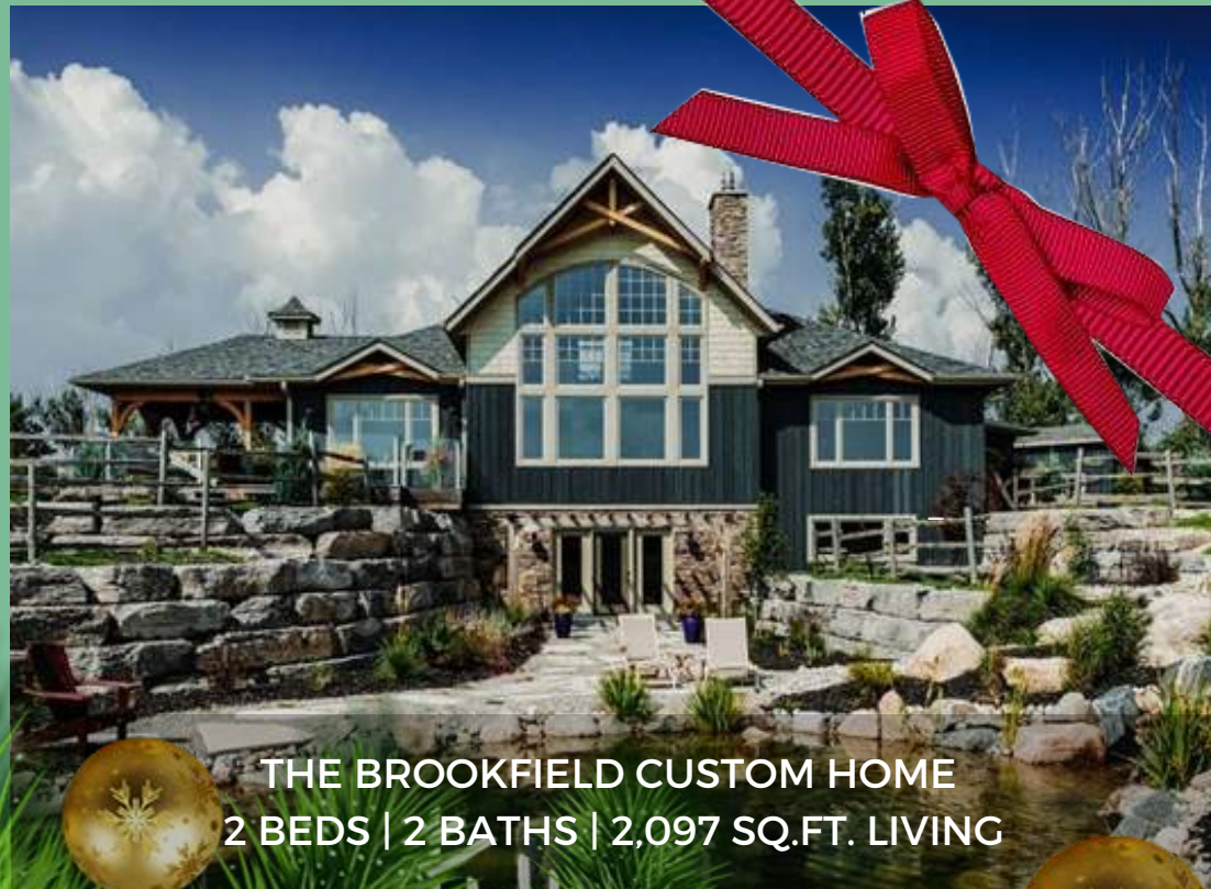
THE BROOKFIELD CUSTOM HOME 2 BEDS | 2 BATHS | 2,097 SQ.FT. LIVING