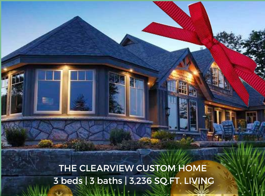
THE CLEARVIEW CUSTOM HOME 3 beds | 3 baths | 3,236 SQ.FT. LIVING