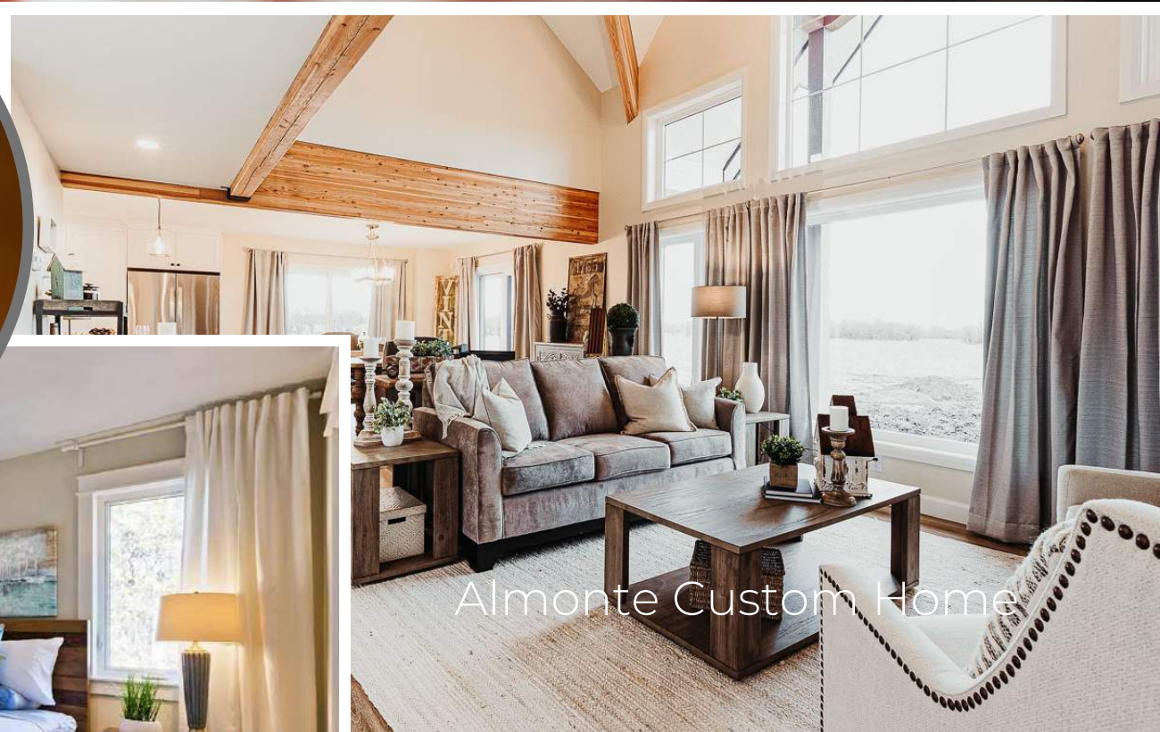
Almonte Custom Home

Heavier window coverings saves you money on your electricity bills.